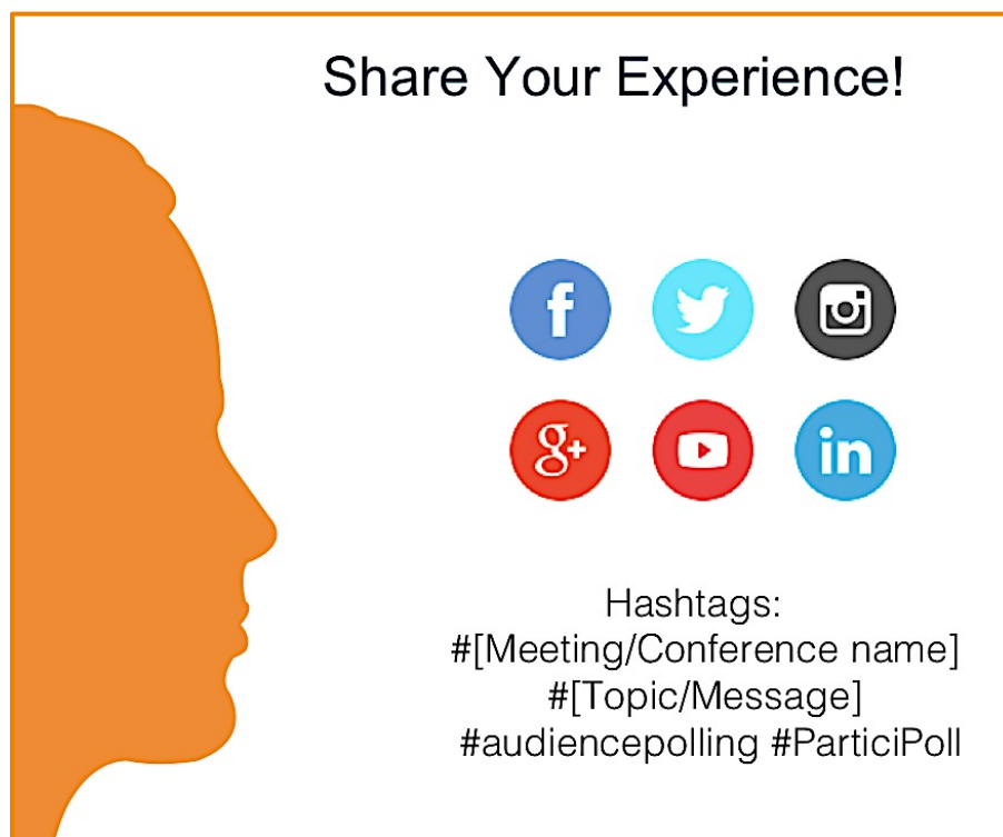
Figure 4: Example Slide At The End Of The Session Can Help Drive Earned Media For Your Content/Subject

Ending the presentation and session with a slide reminding the audience to tweet or post their experiences, and provide relevant hashtags (Figure 4).